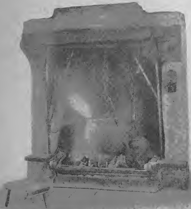
The Kettle's Song